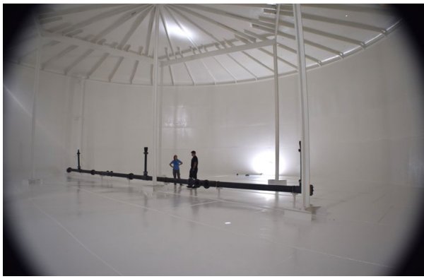
2025 Tank Rehab Project